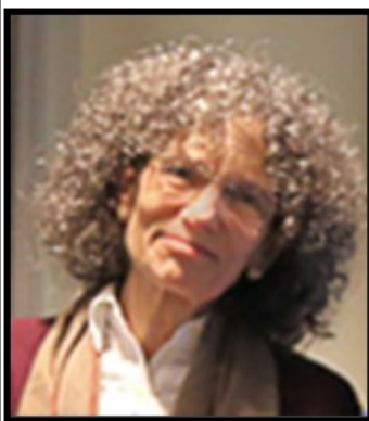
FROM THE PROGRAM COMMITTEE