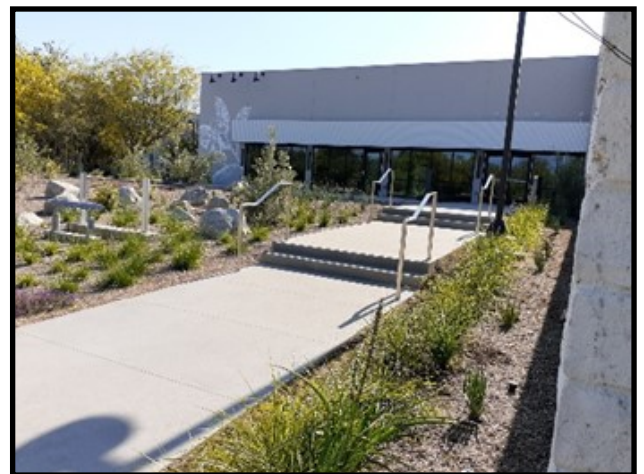
Newly Finished Exterior of Orchard Convention Center