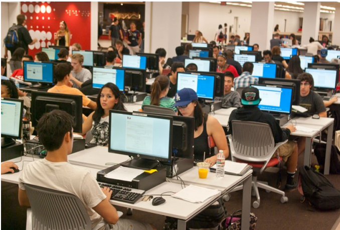
STUDENTS ENJOYING TECHNOLOGY WORKSTATIONS