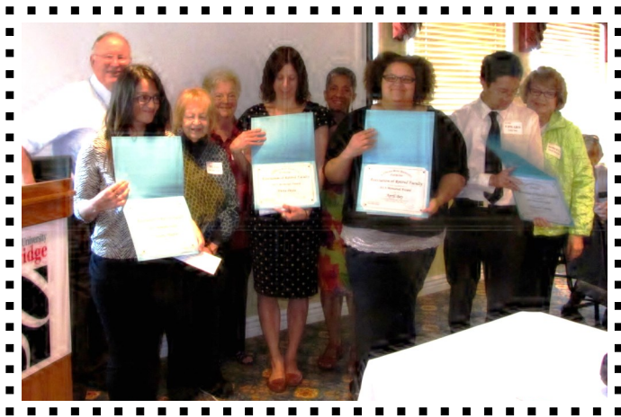
SCHOLARSHIP WINNERS AND SELECTION COMMITTEE