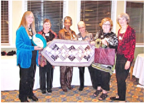
NeedleArf members display a project