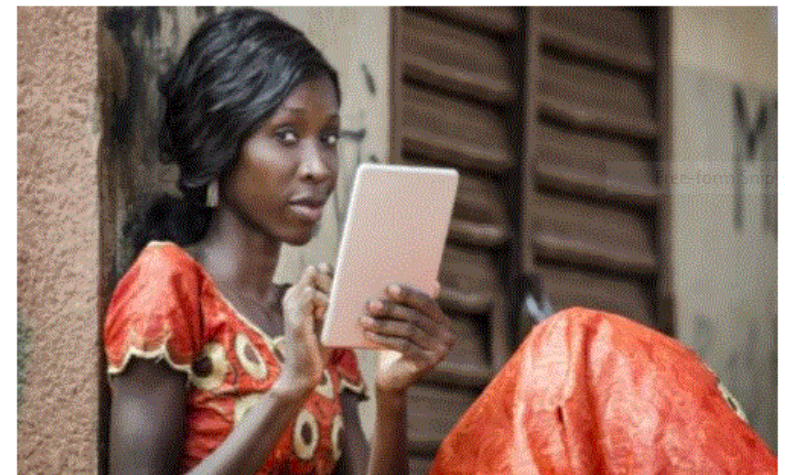
BitPesa, headquartered in Kenya, created an award-winning app that uses digital currency to lower the cost of remittances and SME business payments to and from Africa