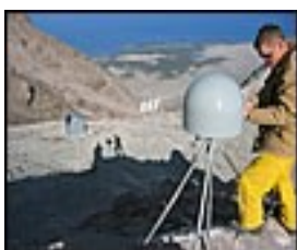
GPS receiver installation

Professional geologists in industry, education, and research are particularly active in the state of California. This course will give you an overview of some of these fields including environmental science, engineering geology, hydrogeology, atmosphere and oceanographic science, earthquake geology and geophysics