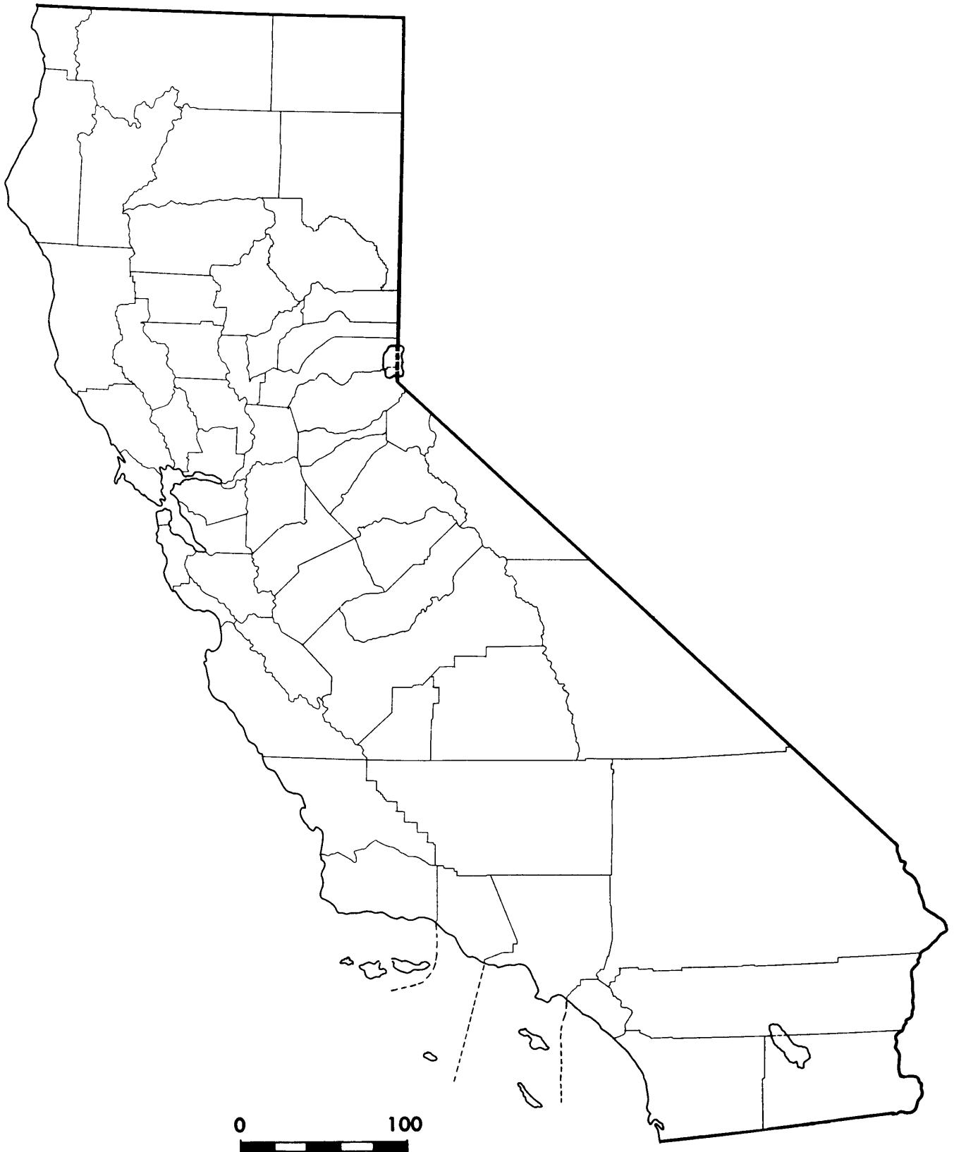
Albers Equal Area Projection