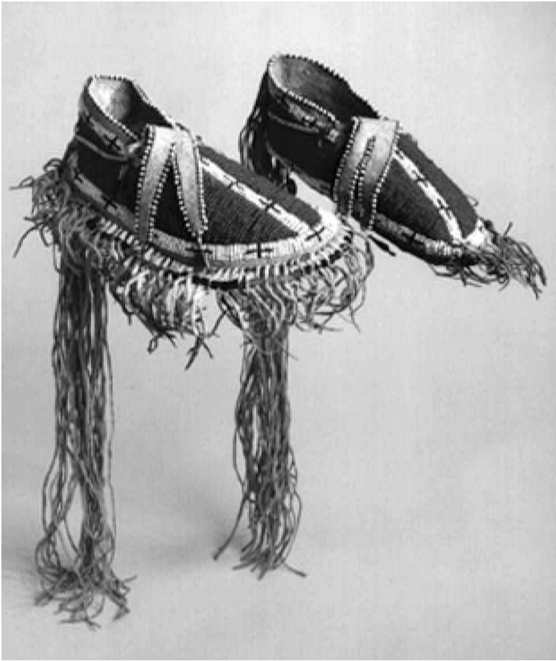
4. This photograph, captioned “Beaded moccasins, ca. 1860. Upper Missouri River,” appears in the Creation’s Journey catalogue.

hind the much smaller MAA’s exhibits, visitors to “Masterworks” are told that many Native people were involved in choosing and annotating exhibits. As is the case throughout the Museum, each such person is authenticated by tribal identity, marked in the parentheses familiar to every Native American. Despite such obvious efforts to lend the exhibition (and the Museum) a clear “Native” identity (the stated raison d’être of this “new museum”), most of those involved here bear no such authenticating markers and are, in fact, non-Native.