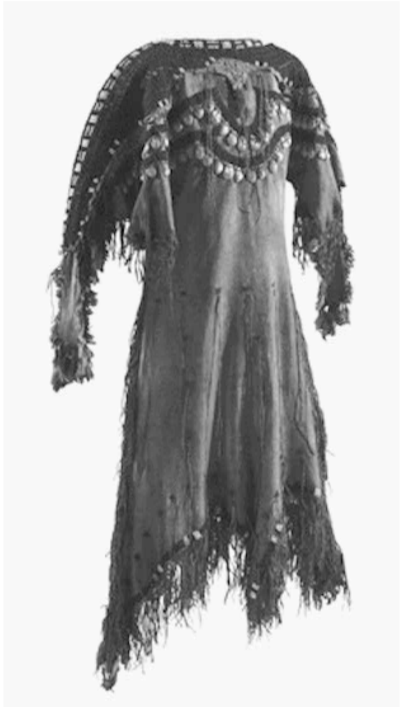
6. This image shows a girl's dress (ca. 1850, Northern Plains) exhibited at the National Museum of the American Indian, though here without its cement occupant.