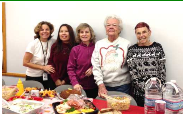
Holiday luncheon for the Granada Hills Library staff at the Library on December 10, 2013.

On behalf of the Granada Hills Branch staff, we are so appreciative and overjoyed about the holiday luncheon you provided. It was truly lovely with the full sandwich spread and variety of salads, and of course, the conversation with you as we ate. We were absolutely overjoyed and thrilled for this surprise, and some of us "long-time Granada staff" never remember having such appreciation shown to the staff from the Friends group. Thank you all for the thoughtfulness you extended to us, and making our holidays bright. You are always so supportive! Thank you again. Sincerely, the librarians, clerks and messenger clerk staff members.