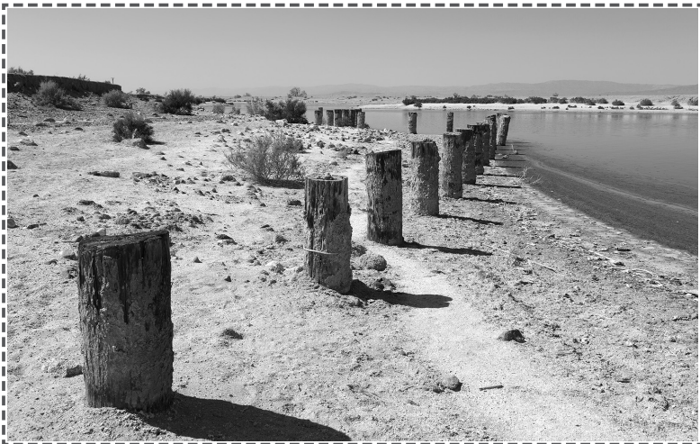
The Salton Sea.