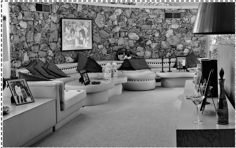
Elvis Presley honeymoon house in Palm Springs.