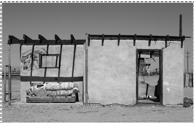
Abandoned building near the Salton Sea.