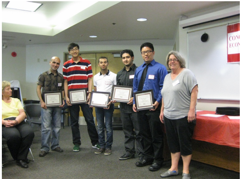
CME Group Trading Challenge Participants