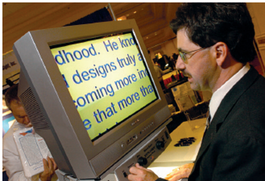
A participant at a recent Technology and Persons with Disabilities Conference tries out a type of print magnification system called a CCTV Magnifier.

alternative formats, including Braille, large print and disk (ASCII). Sign language interpreting services and assistive listening devices also will be widely used at the conference.