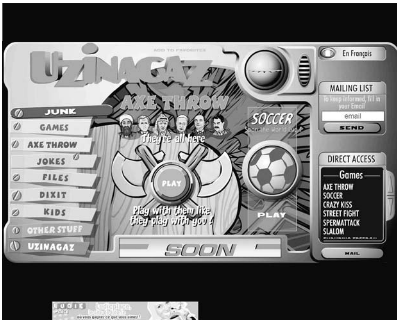
15. Axe Throw , a French computer game on the Internet, lets you “Play with them like they play with you!” An “Evil” that cannot be located and captured is fueling a shadow war that uses voodoo violence to do to an elusive enemy what the war on the ground could not. (< http://www.uzinagaz.com >)

The exhibition became a lightning rod for polarized debate even before it