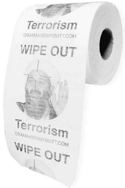
17. Wipe Out Terrorism , an example of voodoo violence using weapons of degradation. Two hundred rolls of toilet paper bearing Bin Laden’s portrait were sent to the Pentagon in March 2002 and could be purchased at Ground Zero shortly thereafter. (< http://politicalhumor.about.com/library/graphics/osama_tp.jpg >)

There are no protocols for this situation. Should people have been allowed to see the site? Should they be permitted to take photographs? During the first few months after 9/11, the owner of NYC Tours refused to organize excursions whose sole destination was Ground Zero, but considered it important to stop at the disaster site in the context of a standard city tour (Saulny 2001:11). While the city’s economy depends on tourism and those figures dropped precipitously after 9/11, there was reluctance to promote tourism that could be seen as profiting