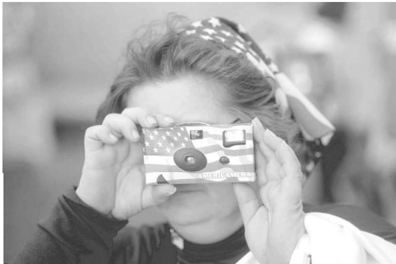
3. Americamera at Ground Zero (3 November 2001).