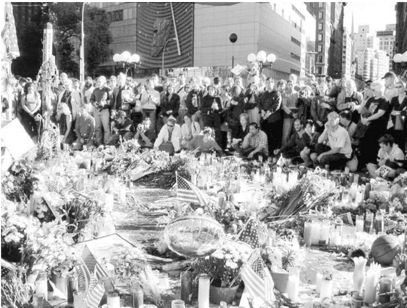
9. Union Square, which starts at 14th Street, the line that demarcated the frozen zone, became the focal point for spontaneous gatherings, vigils, and memorials (14 September 2001).

No wonder then that such exhibitions have become a place to mourn. Some viewers attend to the many photographs taken by thousands of eyewitnesses in order to pay respect to victims and rescuers. Others look at the pictures to impress upon themselves the magnitude of the disaster, even as its meaning remains elusive. Exit Art, which defines itself as a "non-profit interdisciplinary laboratory for contemporary culture," approached these issues by putting out a call for responses to 9/11 (Exit Art 2001). The only requirement was that all submissions be on an 8.5 × 11-inch piece of paper. Contributors submitted writings, drawings, photographs, and collages. The curators decided to accept everything. There was to be no selection. Responses came from professional artists, ordinary people, and even homeless individuals with no return address. The result, some 3,500 submis-