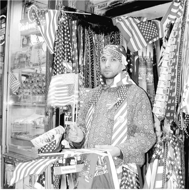
6. Flag seller, Wall Street. The disaster was quickly followed by political and commercial exploitation of an initial surge of spontaneous patriotism. The flag also became protective coloration for those who felt vulnerable in an increasingly xenophobic atmosphere (27 September 2001).

discovering the concrete consequences of the attack made the reality of the catastrophe sink in. Those consequences were conveyed not only through the media, but with even greater immediacy by the many shrines and memorials that blanketed the city. At the center of those shrines were Kodak moments in the lives of the missing and presumed dead. In the absence of a body, a photograph became the only tangible address to which mourners could bring their prayers. Indeed, as it became increasingly clear that photographs were virtually useless for identifying missing persons—only DNA evidence from body fragments would do—photographs became “paper monuments in the stone cemetery of the city” (Kuzub 2001). Surrounded by flowers and candles, teddy bears, and items of clothing, they became votive objects. But, unlike a tombstone that marks a singular grave, these paper monuments, photocopied on standard 8.5 \times 11 -inch sheets, multiplied the spectral presence of the missing. They were now literally in more than one place at a time, but nowhere to be found. They were announced, but not laid to rest. Families of the confirmed or presumed dead were given a handful of dust from the site. Reverend James P. Moroney advised bishops “that if dust from the site was reasonably believed to contain human remains—of anyone—it could be buried by a grieving family in place of a body” (Wakin 2001:B9).