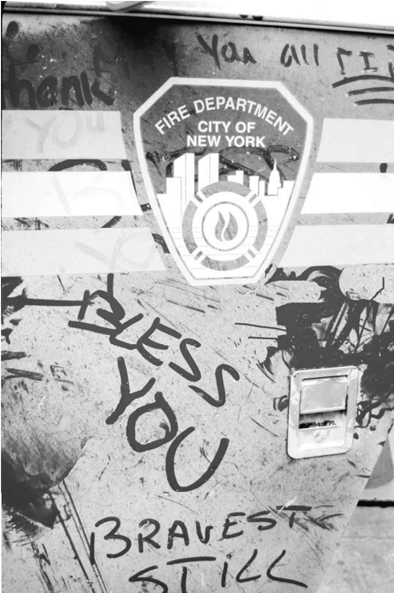
11. Writing in dust on a fire truck near Ground Zero (13 September 2001).

ilies (George 2001). The cockpit recordings from the doomed planes are also sonic artifacts, even if they cannot be made public. Some of the families of those who perished in the plane that crashed into a field in Philadelphia were brought together in a closed room to listen to the cockpit recording, with the understanding that they would not reveal its contents.