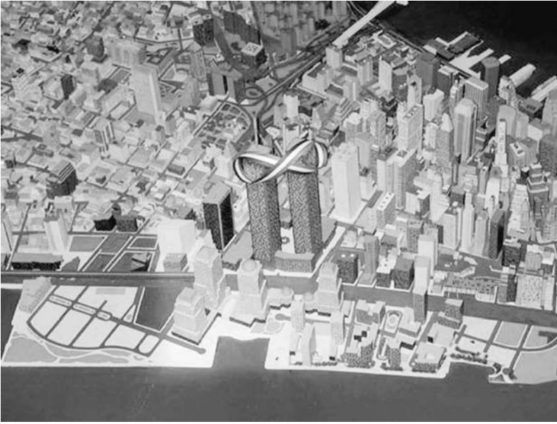
10. Panorama of the City of New York, updated to 1993, Queens Museum of Art. After 9/11, the twin towers, still standing, were tied with a mourning ribbon and spotlighted. This panorama, the largest architectural scale model in the world, was originally commissioned by Robert Moses for the 1964 New York World's Fair (13 October 2001).